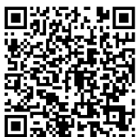
Interactive Trail Map